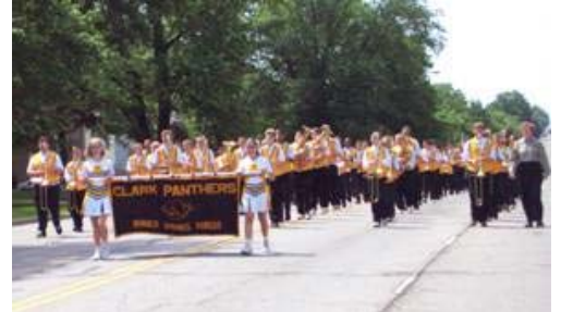
The Turkey Creek Festival Parade is a highlight of Merriam's largest festival, which annually draws up to 10,000 people.

BACKGROUND: The Merriam Turkey Creek Festival is an annual event held the 3rd Saturday in May by the City of Merriam, Kansas. This event is a celebration of Merriam's heritage featuring an arts and crafts show, 5K run/walk, concerts, free kids activities, concessions, parade, and more. For more information about the Turkey Creek Festival or associated events, please contact the Merriam Parks & Recreation Department at (913) 322-5550 or visit www.merriam.org/park .